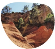
LUBERON VALLEY, FRANCE

Examples of Established UNESCO Geoparks: