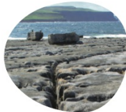
ENGLISH RIVIERA, ENGLAND